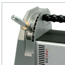
Grind the electrode in the desired angle.