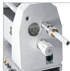
Cut the electrode by turning the handle.