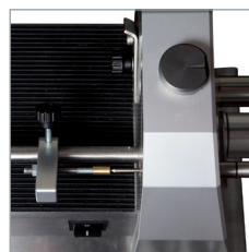
Set the cutting length.