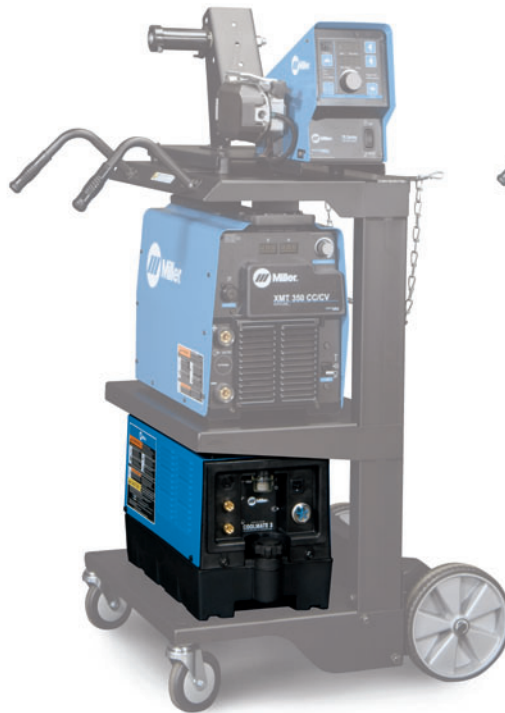
Coolmate 3 shown with XMT® 350 MIGRunner™