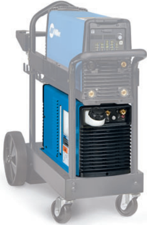
Coolmate 1.3 shown with Maxstar® 280 DX TIGRunner®