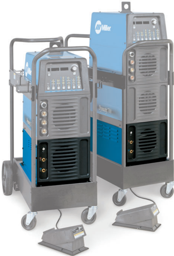
Coolmate 3.5 shown with Dynasty® 400 TIGRunner® and 700 TIGRunner®