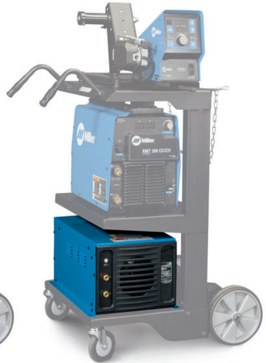
Coolmate 3.5 shown with XMT® 350 MIGRunner™