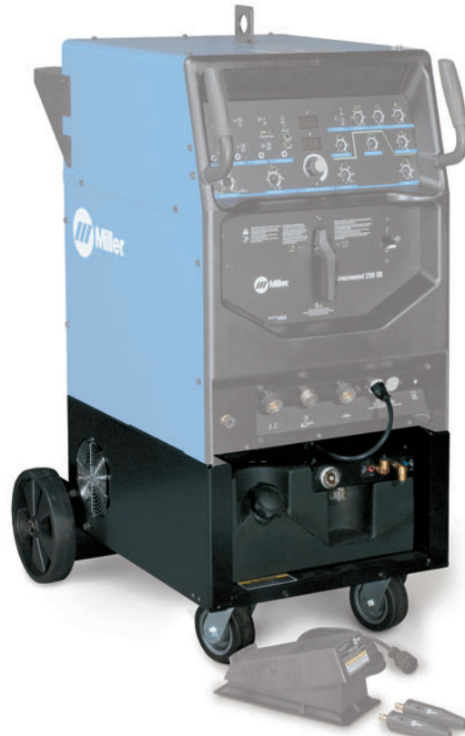
Coolmate 3X shown with Syncrowave® 250 DX TIGRunner®