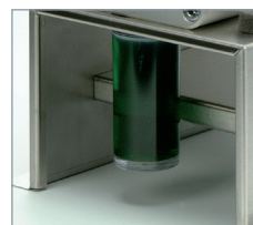
Sealed disposable container for dust collection and disposal.