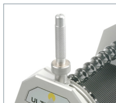
Tip may be flattened by 1/10 mm per point in the 90° position.