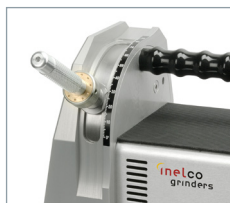
Grinding angle from 7.5 - 90° creates accurate electrode tip angles of 15 - 180°.