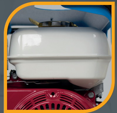
3,1 Lt Fuel Tank