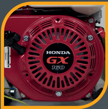
Honda GX 160 Engine