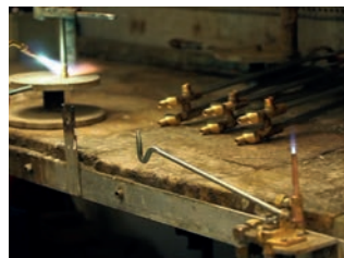
Tiny flame available during work