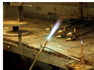
Fluent adjustment of the flame