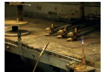
Automatically off when not used