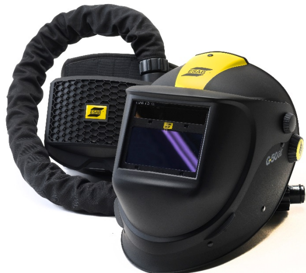
G50 Air with ESAB PAPR