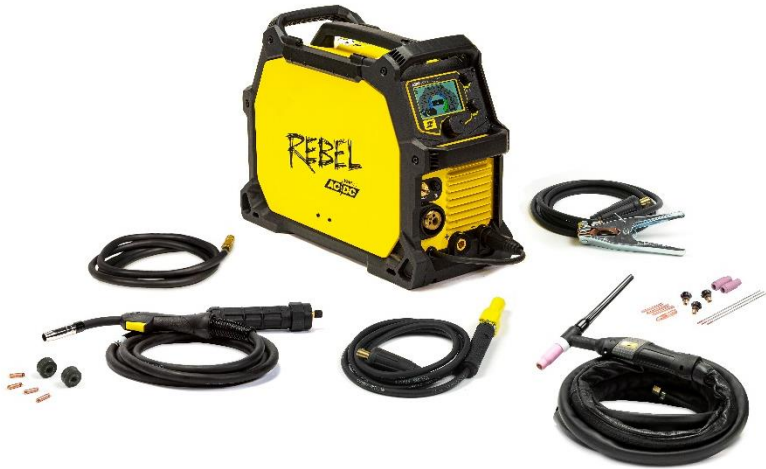
Rebel EMP 205ic AC/DC and accessories.

We made the impossible possible with the first-ever portable, all-process machine, complete with MIG, Flux-Cored, MMA, DC TIG, and now AC TIG capabilities, which means – yes – it TIG welds aluminium. It is a TRUE all-in-one welding system that delivers best-in-class performance in each process in the most portable, durable, go anywhere, weld anything industrial package on the market today.