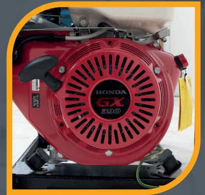
Honda GX390 Engine