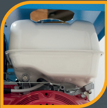
6,1 It Fuel Tank