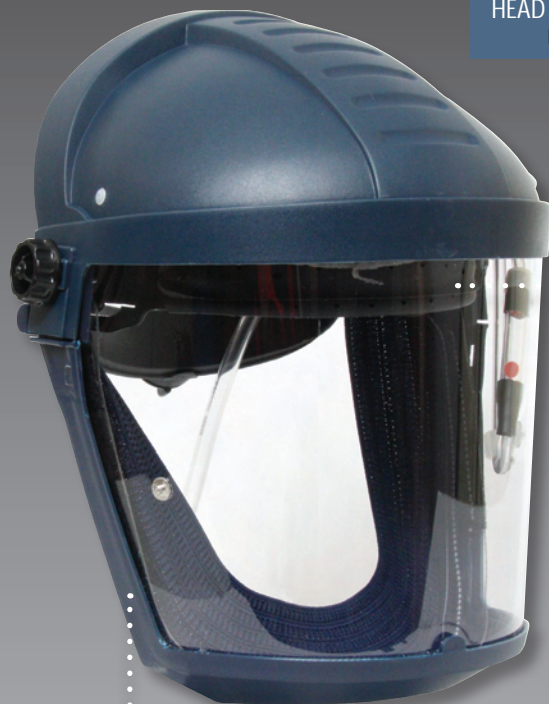
HEAD HARNESS: Nylon