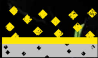
REPLACEABLE 2-STAGE TH2P LEVEL FILTRATION

The advanced PAPR air system uses simple push-button controlled airflow adjustment, allowing from 170 – 220 litres per minute through a replaceable P3 filter. The PAPR delivers an audible signal that notifies the user that the filter needs to be replaced. A high-capacity rechargeable lithium-ion battery powers the quiet (70 db) blower system for up to 8 hours between charging.