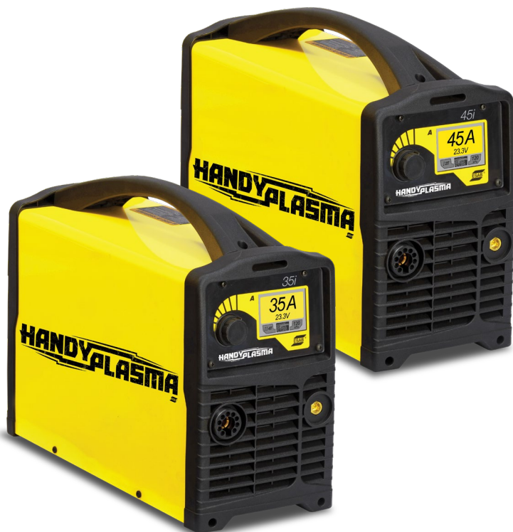
HandyPlasma 35i / 45i